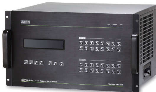
VM1600 Front view