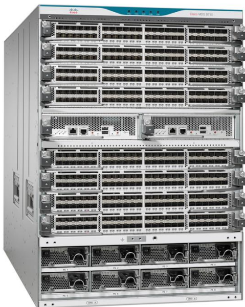
Figure 1. Cisco MDS 9710 Multilayer Director

Enable enterprise clouds. Transform large storage networks. Lower operating costs. Deploy Fibre Channel, IBM Fibre Connectivity (FICON), and Fibre Channel over Ethernet (FCoE) on a single fabric. With the Cisco® MDS 9710 Multilayer Director (Figure 1), you'll meet the stringent requirements of large virtualized storage environments. As a director-class SAN switch, the Cisco MDS 9710 uses the same operating system and management interface as other Cisco data center switches. It brings intelligent capabilities to a high-performance, protocol-independent switch fabric. You'll gain uncompromising availability, security, scalability, simplified management, and the capability to flexibly integrate new technologies.