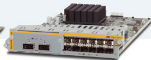
SBx81XLEM with Q2 module