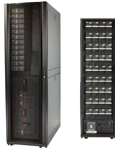
3-in-1 modular power distribution, maintenance bypass, and battery cabinet