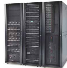
Symmetra PX 96 with power distribution and 6 minutes of runtime (PF=1)