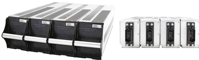
Modular batteries provide reduced MTTR, scalable runtime, and battery monitoring at the individual module level