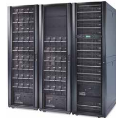
Symmetra PX 160 with 6 minutes of runtime (PF=1)