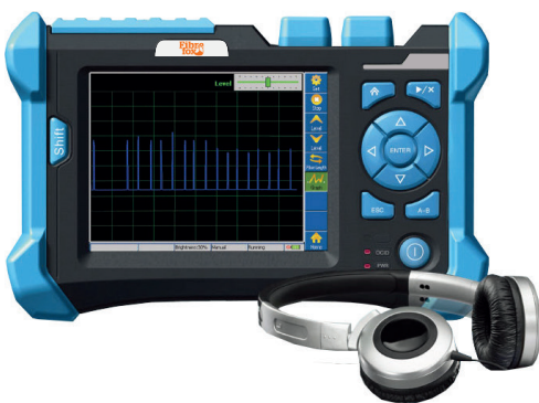
Optical Cable Identifier