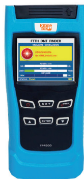
FTTH ONT Finder