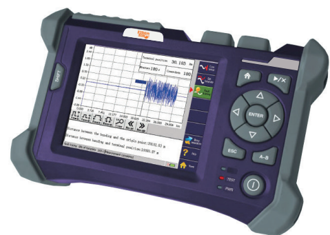
Optical Cable Fault Tracker (OCFT)