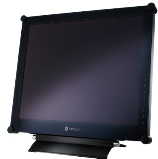
Front-panel keypad with Input Select, Screen Menu, Contrast and Brightness controls for quick adjustments