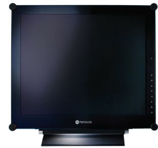
Available in black or white