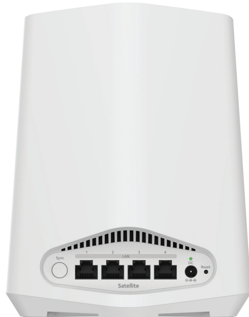
Orbi Pro WiFi 6 Mini Satellite (SXS30)