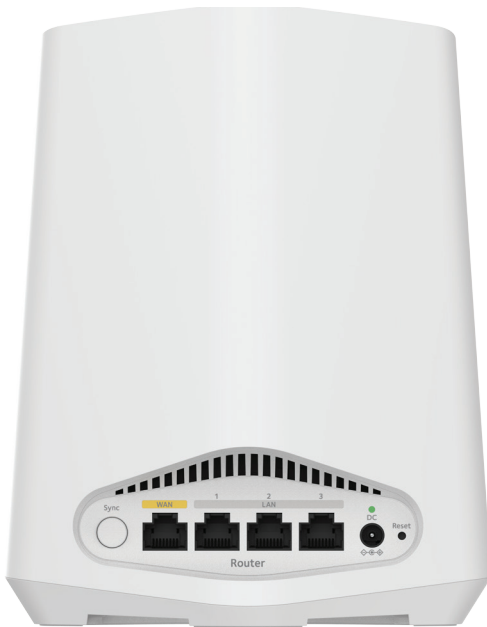
Orbi Pro WiFi 6 Mini Router (SXR30)