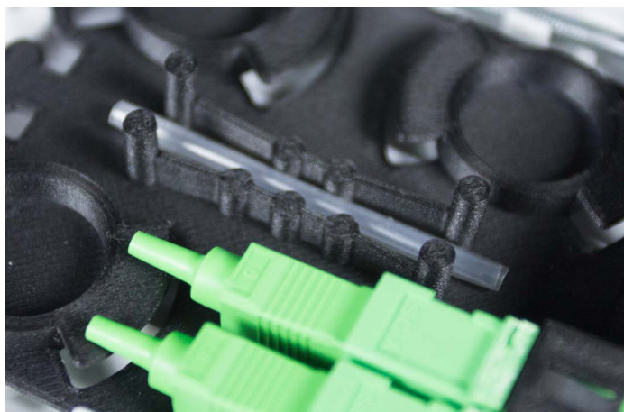
Splice holder pictured above.