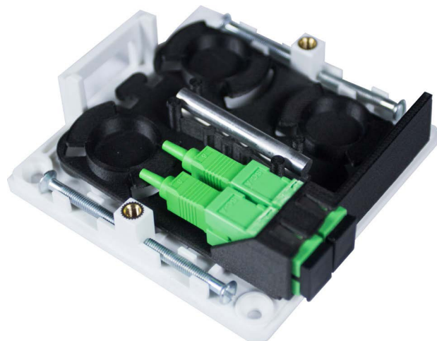
Fibre splitter pictured above, resting on top of the splice holder.