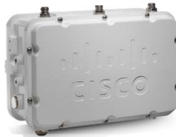
Figure 1. Cisco Aironet 1524

The Cisco Aironet 1524 is preconfigured with three radios compliant with IEEE 802.11a, 802.11b/g and 4.9GHz public safety standards. Various uplink connectivity options are supported such as Gigabit Ethernet (10/100/1000BaseT), and small form-factor pluggable (SFP) for fiber interface. Power options supported include 480VAC, 12VDC, Power over Ethernet (POE), and internal battery backup. It also employs Cisco's Adaptive Wireless Path Protocol (AWPP) to form a dynamic wireless mesh network between remote access points, while delivering secure, high-capacity wireless access to any Wi-Fi-compliant client device (Figure 2).