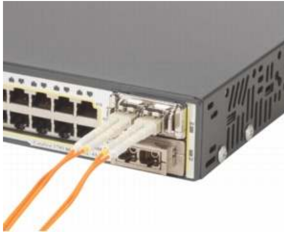
Figure 4. Cisco TwinGig Converter Module converts each 10 Gigabit Ethernet X2 Interface into Two Gigabit Ethernet SFP Ports with Catalyst 4500 Supervisor 6-E