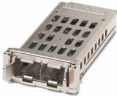
Figure 1. Cisco TwinGig Converter Module

The TwinGig SFP Converter Module (Figure 2) converts a 10 Gigabit Ethernet X2 interface into two Gigabit Ethernet Small Form-Factor Pluggable (SFP) ports. This way, customers can initially use the switch with Gigabit Ethernet uplinks (Figure 3) and later implement 10 Gigabit Ethernet uplinks as business demands change, without having to upgrade the access layer.