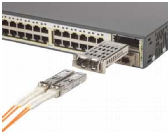
Figure 2. Cisco TwinGig Converter Module Converts a 10 Gigabit Ethernet X2 Interface into Two Gigabit Ethernet SFP Ports in the Catalyst 3750-E and Catalyst 3560-E Series Switches.

The TwinGig SFP Converter Module can also be used with the Cisco Catalyst 4500 E-Series Supervisor 6-E (Figure 4) and the Cisco Catalyst 4500 E-Series 6-Port 10 Gigabit Ethernet Line Card (Figure 5).