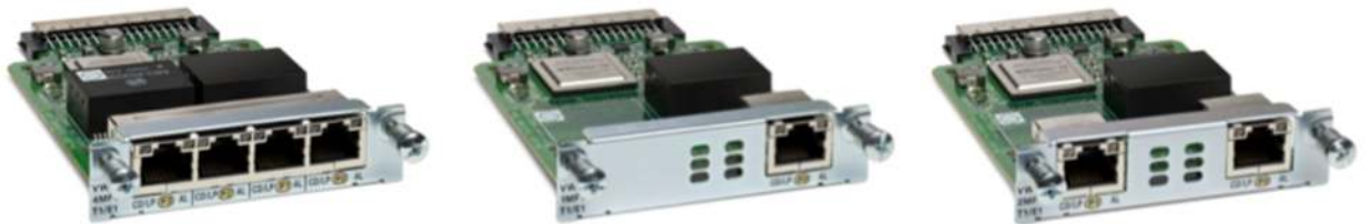
Figure 1. Cisco 1-,2- and 4-Port T1/E1 MFT VWIC3

The Cisco MFT VWIC3 interface cards add improvements over the Cisco Second-generation 1- and 2-port T1/E1 Multiflex Voice/WAN Interface Cards (MFT VWIC2s). The Cisco 2- and 4-port MFT VWIC3s enable each port to be clocked from an independent clock source for data applications. Voice applications can now be clocked independently from data applications, with all ports for voice applications clocked from a single source. The Cisco MFT VWIC3s use the ECAN on the motherboard PVDM cards with up to 128ms echo-tail length for demanding network conditions. MFT VWIC3 cards support up to 2 channel groups per T1/E1 port for serial data applications. Refer to Table 3 for all configuration options offered with the MFT VWIC3 cards.